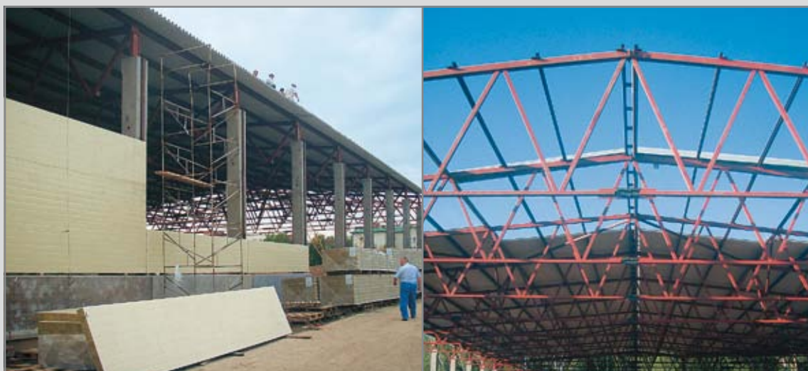
THE RUSPRINT PRODUCTION, ADMINISTRATIVE AND LIVING FACILITY, VIDNOYE, MOSCOW AREA