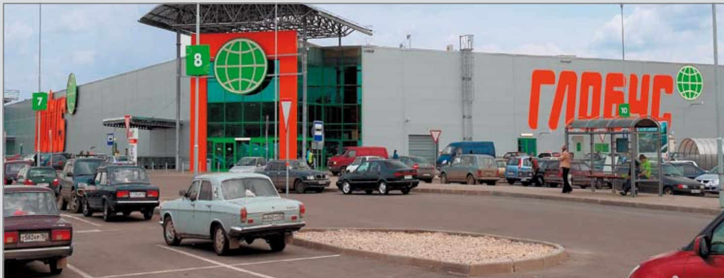
GLOBUS HYPERMARKETS KLIMOVSK, MOSCOW AREA, RYAZAN, YAROSLAVL